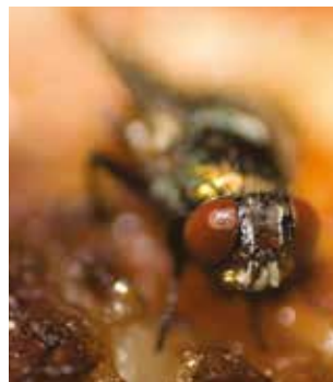
Filth and debris left by the floodwaters create excellent breeding conditions for houseflies other flies and insects associated with decaying organic matter.