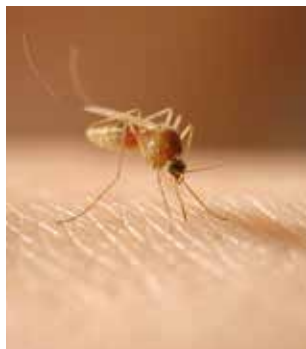
Flooded cellars in particular, can harbour Culex pipiens biotype molestus , a human-biting mosquito.