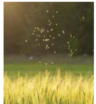
Sites that are very wet, for at least part of the year, may favour the development of biting midges, family Ceratopogonidae.