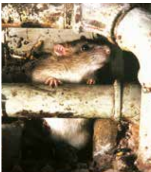
Unwelcome rodents may cause damage to property directly by gnawing or indirectly by depositing faeces and urine.

After flooding, many rodents are displaced from their natural habitat. The rodents will then find areas that provide food, water and harbourage. Inevitably, rodents enter houses, sheds, barns, and other buildings.